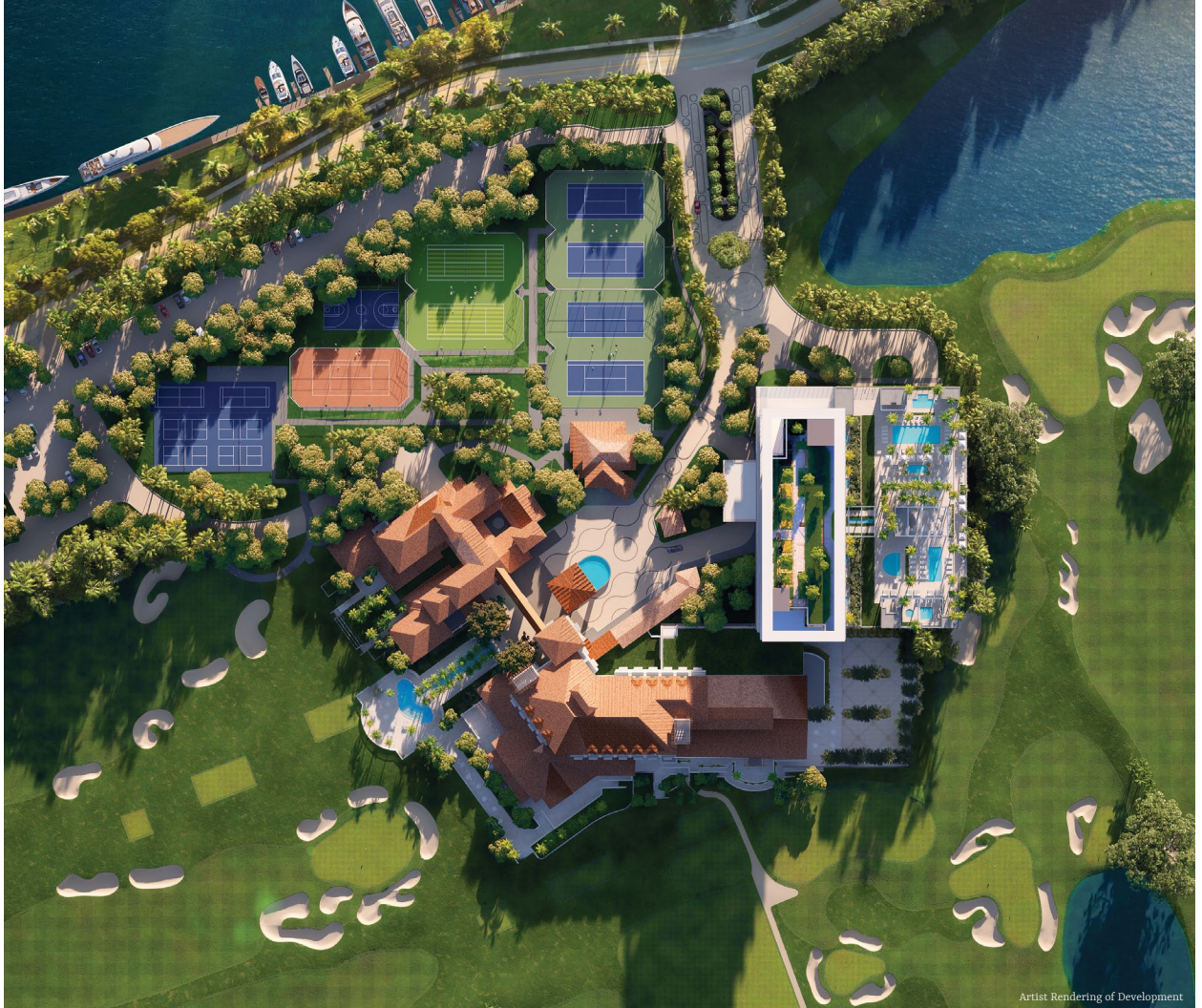
Artist Rendering of Development